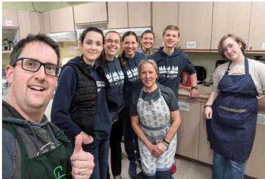
YLT Practical Service @ Friendship House