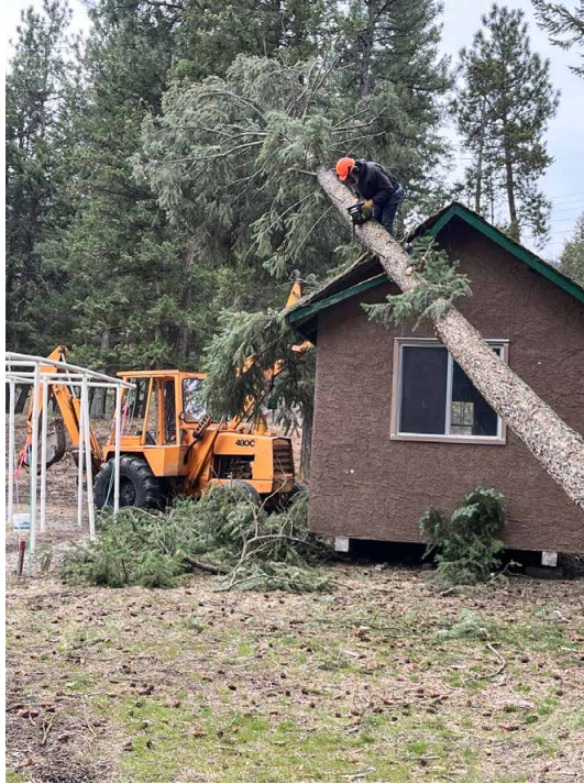
Left: Falkland Camp Pictures Above: Tree that did minimal damage after big wind.