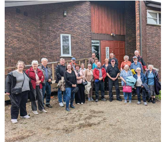
A recent senior's group from Crestwicke Baptist Guelph who visited the Centre

season. We also are expecting a new arrival to our family in early September. There are always adjustments to be made, but thankfully we serve a faithful God who knows our every need and can satisfy the deepest desires.