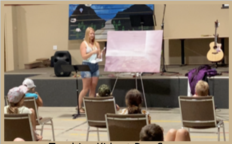
Teaching Kids at Day Camp

Experiencing God's Faithfulness in Canada 🍁