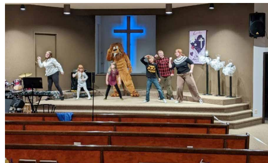
Recording a Children's Ministry Video

a study on 1st and 2nd Peter in February and would value prayer that God would continue to speak to the hearts of the ladies who attend. We have also begun to plan for summer work and are very hopeful that we will be able to schedule a number of in-person VBS programs. Thank you again for your many prayers for our work here and our family!