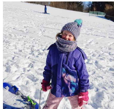
Campbellville Sno Day Fun