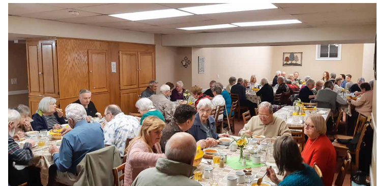
Hymn Sing Lunch