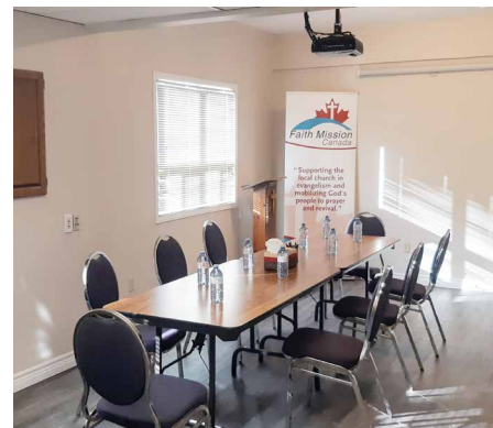
Campbellville Board Room