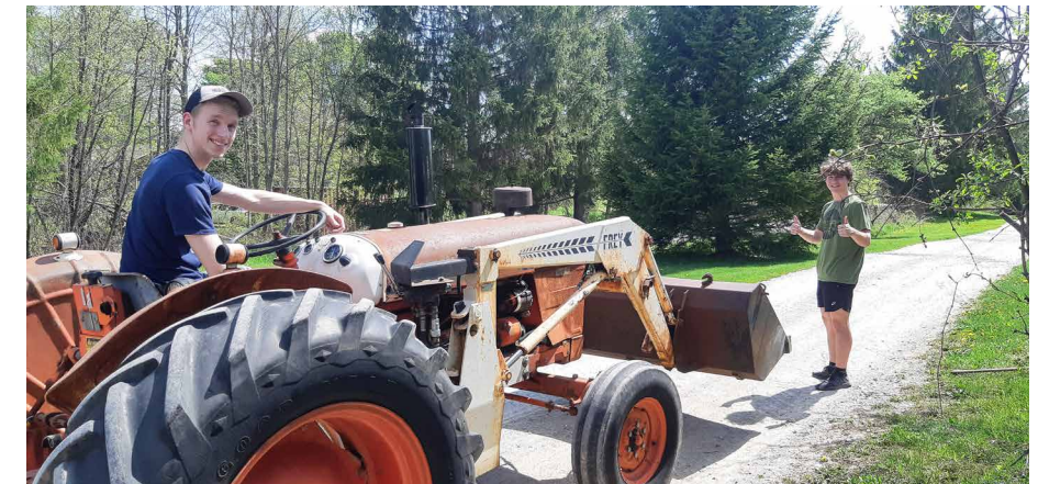
Youth Leadership Training