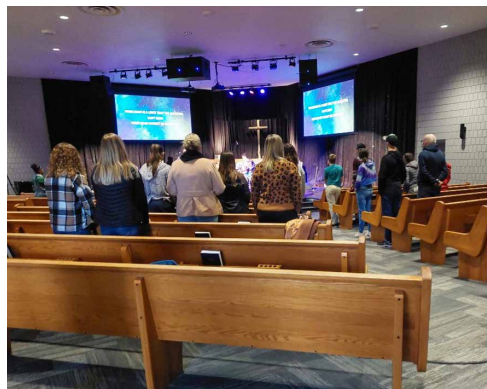
Kingston Youth Network