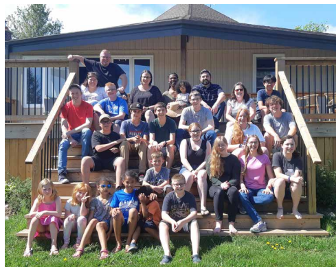
Youth Leadership Training