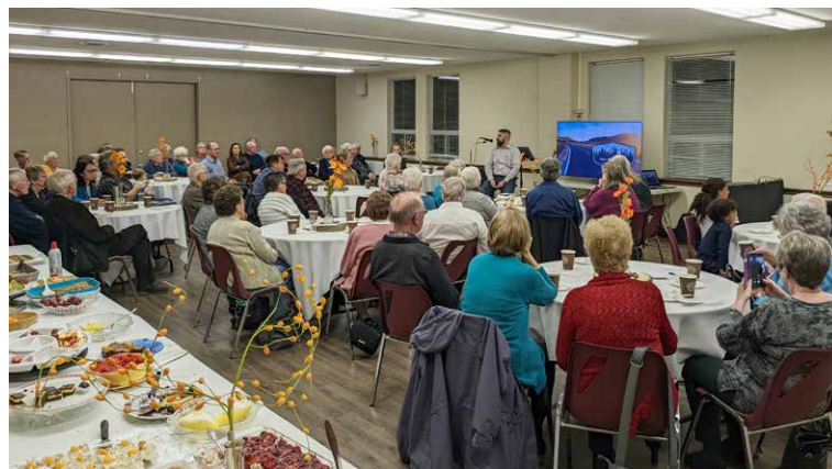
Simcoe Fall Rally