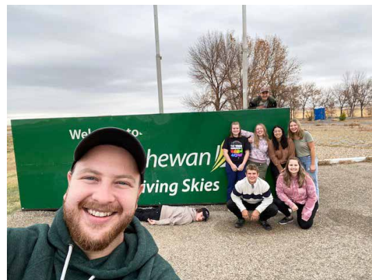
With the Youth