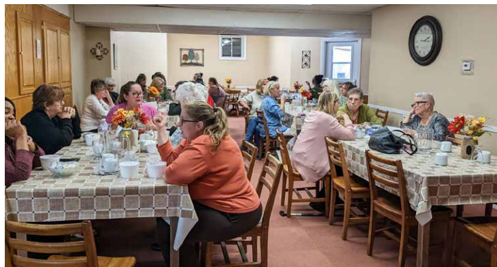
Fall Ladies Retreat