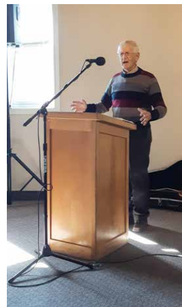
Fall Hymn Sing