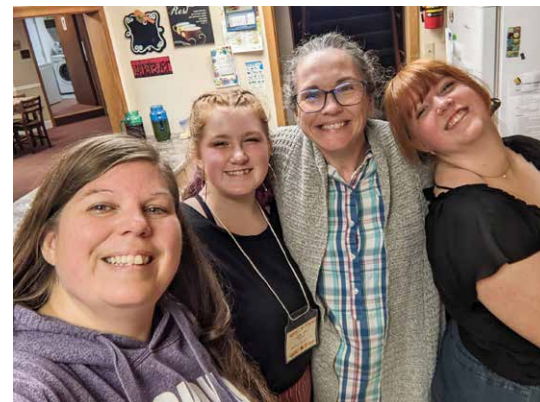
In the Kitchen at the Ladies Retreat