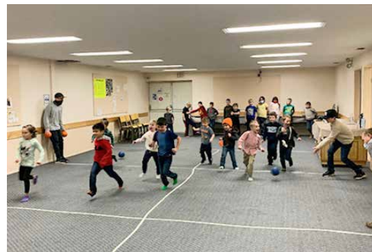
Kids Club at Falkland