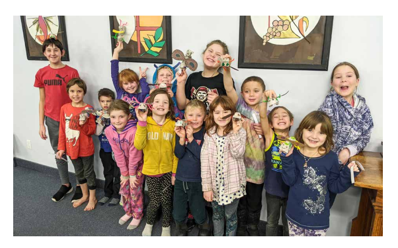
Engelhart Kid's Club, Northern Ontario