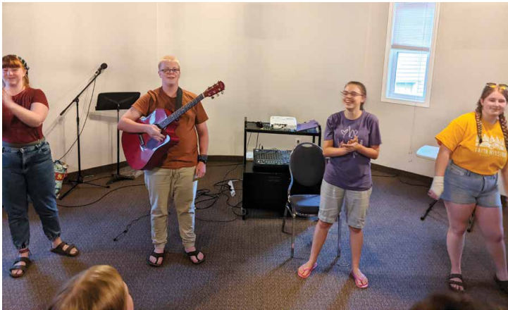
Below: Kids in Stream at Discovery Camp