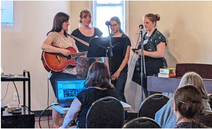
Top Left: Ladies Retreat Worship