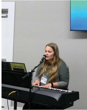
Right & Below Right: Falkland Ladies Retreat Below Left: Falkland Baptism