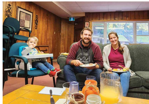
Having lunch during Ladies Retreat

vember. Many of our fellow Faith Mission staff will be coming to help serve at the banquets. We always enjoy our time together! Also, in January we have our kids Sno' Camp weekends. Thank you for remembering us in prayer!