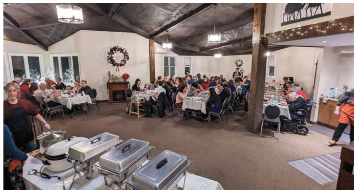
Serving at the Christmas Banquets