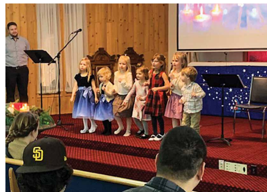
BC Youth Groups and Church Services