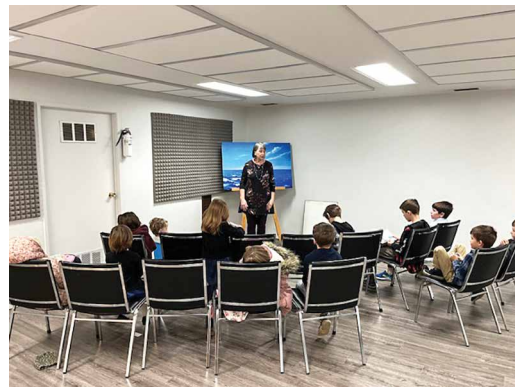
Falkland Kids Club