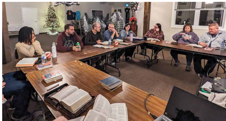
Ontario & Quebec Staff Meeting