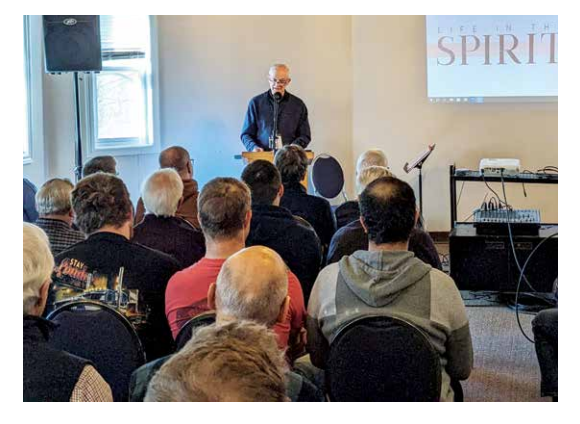
Mens Retreat at Campebellville