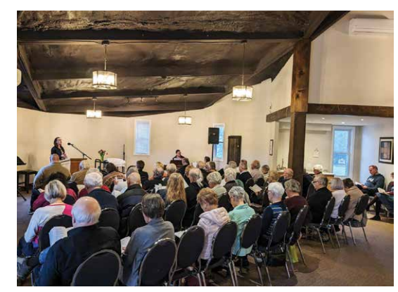
Spring Hymn Sing