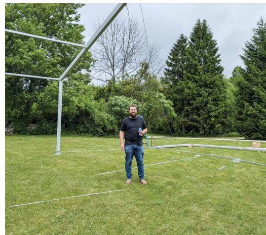
Putting Up the Tent Thirsting for God