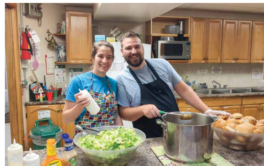
Serving at Summer Camp

This Fall we have some weekend rental groups both catered and self catered. We paused YPH (young people's hangout) for the summer and hope to start again the end of September. We also look forward to the Fall Hymn Sing and Fall Ladies Retreat. As you think of us, please pray for strength and joy as we serve, and for wisdom in reaching out to involve volunteers in this ministry with us. If you can help in some way, we would love to hear from you!