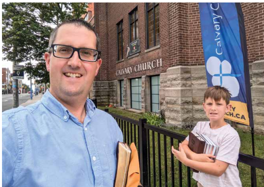
Sunday Preaching, Calvary Church, Toronto

Christmas in the Country Banquets (6 to choose from): Nov 21 thru 29