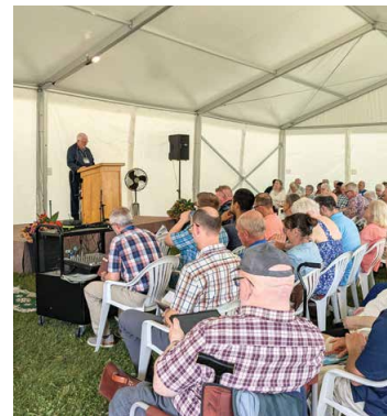
Inside the new Tent at Thirsting for God